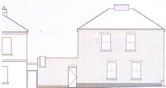
WELLINGTON STREET ELEVATION